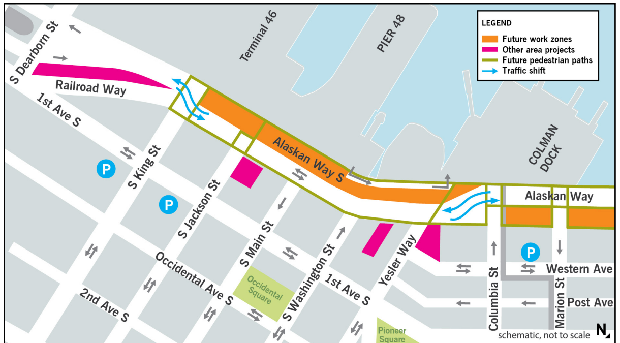
Map of new traffic configuration.